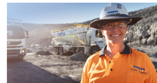
CASE STUDY: PIONEERING THROUGH-SEAM BLASTING AT MOUNT OWEN

Our robust estimating capability delivers fully costed mine plans that give clients economic certainty. Our skilled team of dedicated estimators are part of a multi-disciplinary mine planning team that tests thinking to refine strategies and identify the best options. Detailed costs are analysed and benchmarked against our extensive knowledge bank of diverse operations, further reducing unknowns and contingencies to create a total mine planning package that positions projects for long-term project performance and economic success.